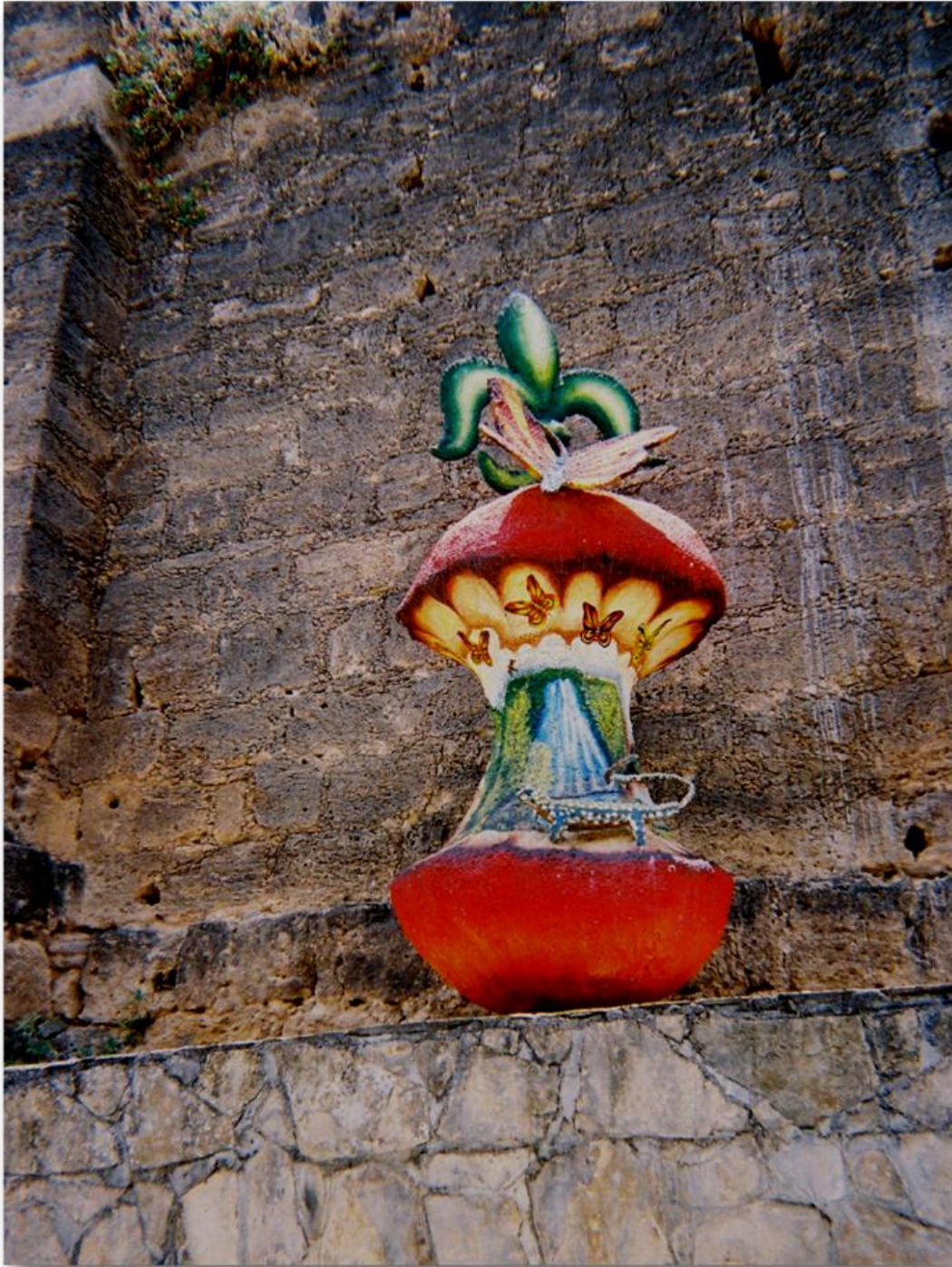
An odd sculpture --- apple core, lizards, butterflies, and a fleur-de-lis. I've no idea of the significance of this to Santiago.