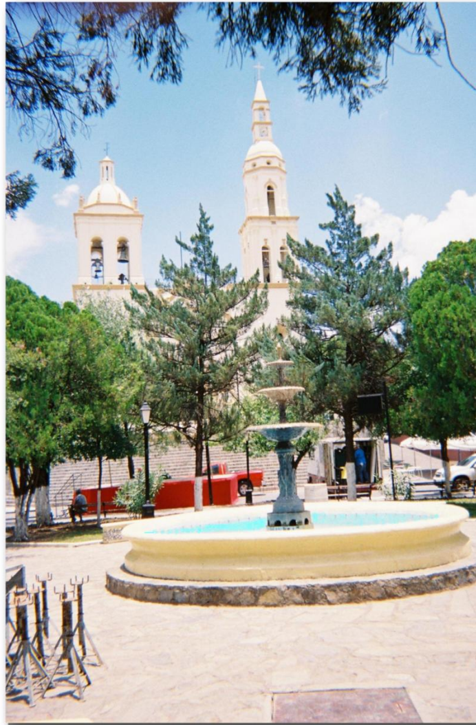
The central plaza, fountain and church of Santiago, NL. Workers are setting up for a carnival.

The following pictures were taken with a little Kodak disposable camera.