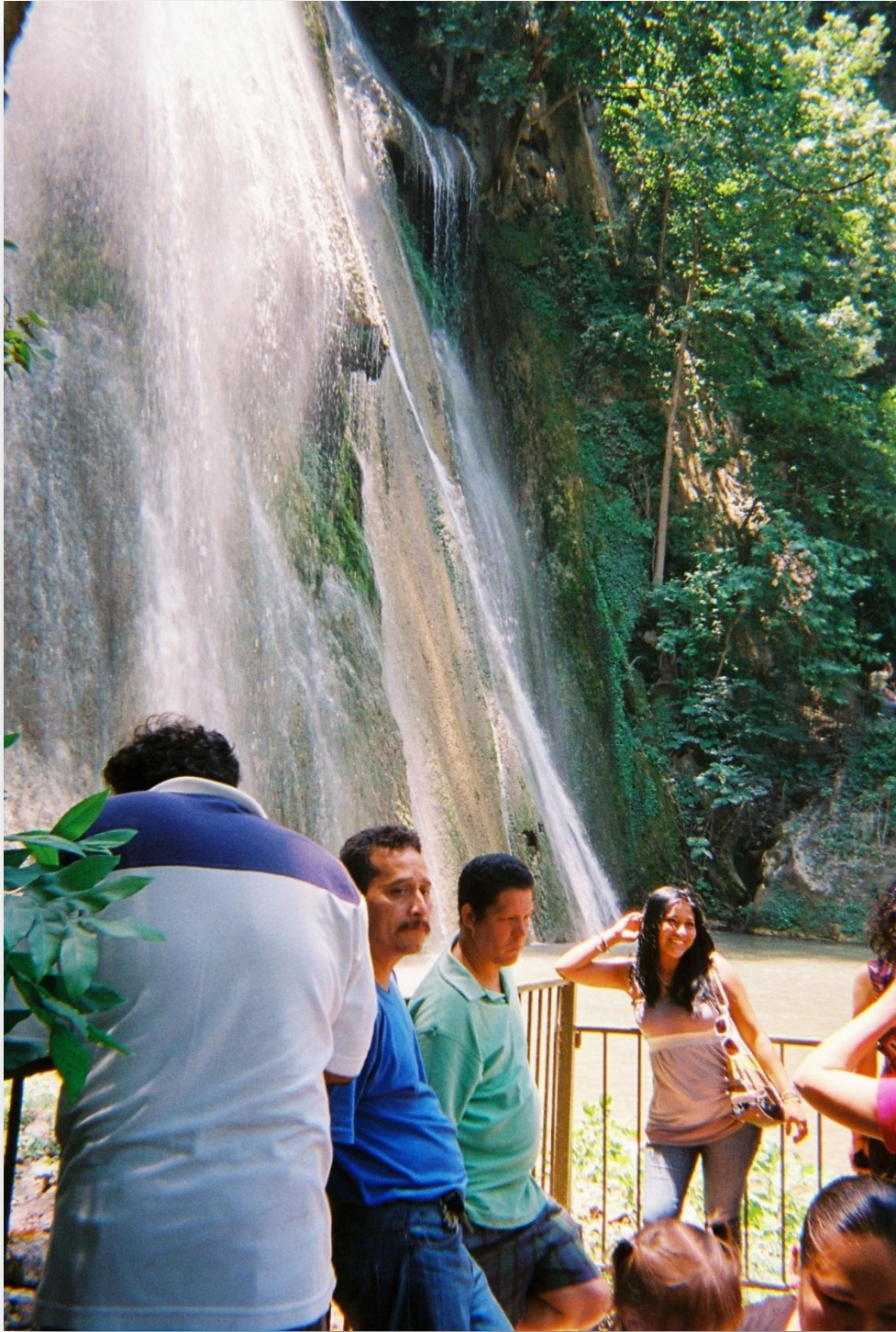
Upper falls at Cola de Caballo park.