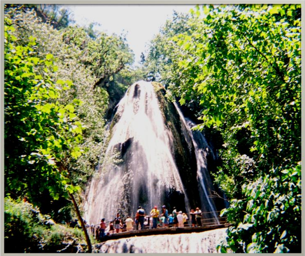
Cascada la Cola de Caballo