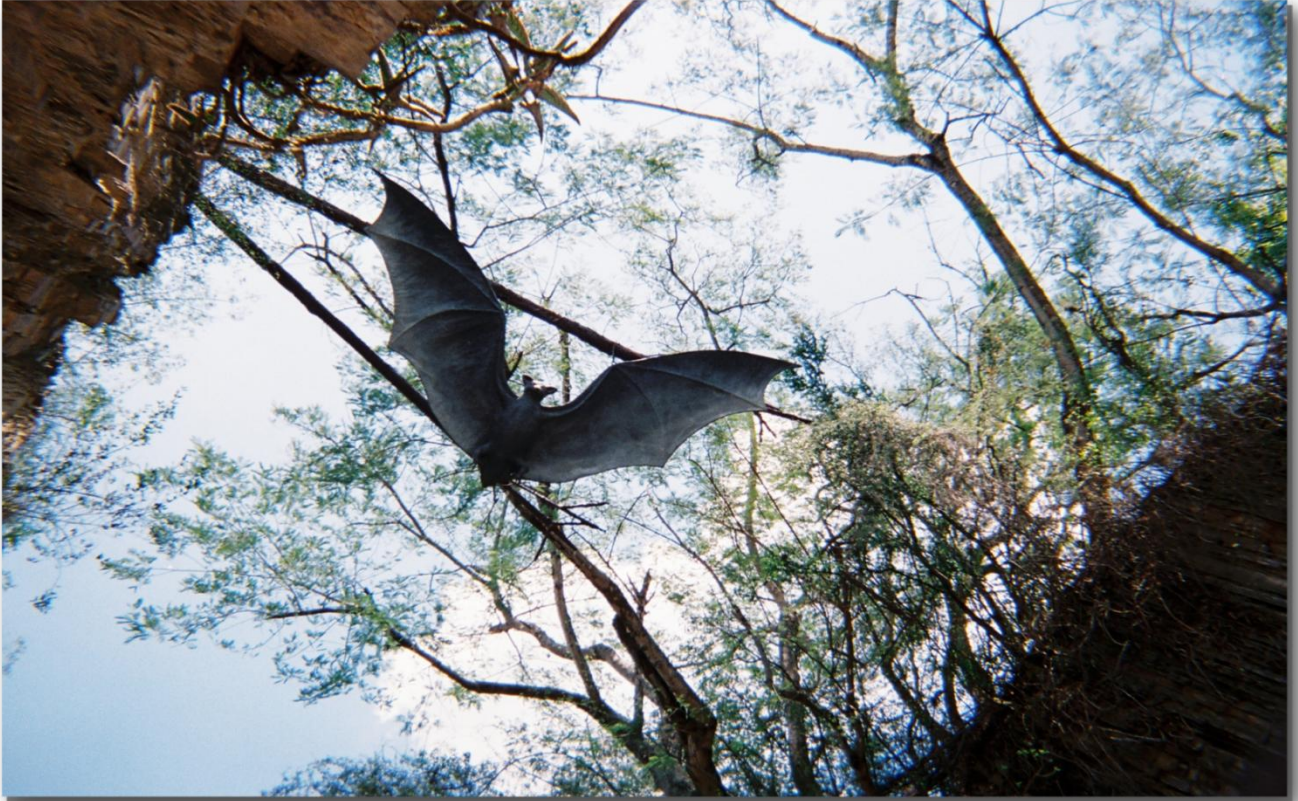
Large metallic sculpture suspended over road, approx. 3-4 m wingspan. Santiago, NL.