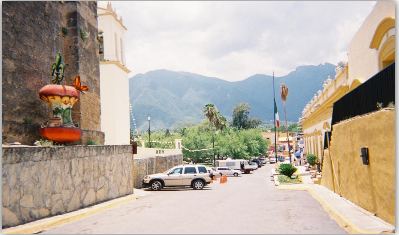
Above: Santiago street – church on left, presidential home on right. Note flag at half-mast.